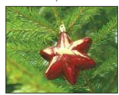
Remember to remove ALL the decorations from your tree before you treecycle!

These collections are for "real" Christmas trees only. Please place broken artificial trees into your trash.