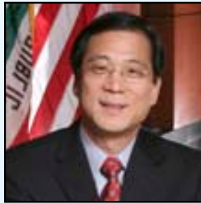
Mayor Sukhee Kang