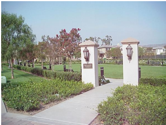
Neighborhood Park - Northpark

City recreational facilities and services include neighborhood parks, community parks and programs, an aquatic center, athletic complexes, a nature center and a fine arts center. The City has ten developed community park sites totaling 179 acres and one special facility of 15 acres. Expansions are planned at two of the park sites and another 45 acre site is in design development. There are 24 public