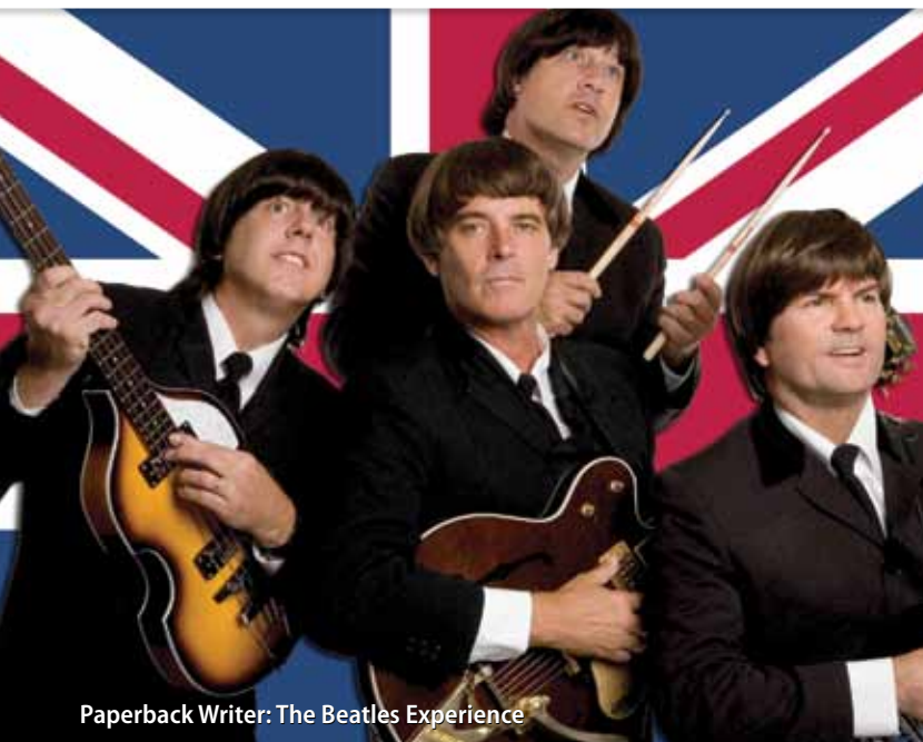
Paperback Writer: The Beatles Experience

The City of Irvine is hosting six free summer concerts, including the Annual Sizzlin' Summer Concert Series and Pacific Symphony's Symphony in the Cities. All concerts will be held at Mike Ward Community Park—Woodbridge. Bring your friends and family for fun evenings filled with great music, food and activities!