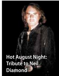
Hot August Night: Tribute to Neil Diamond