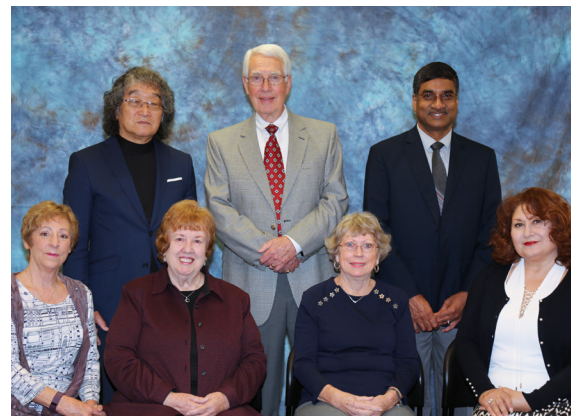
Irvine Senior Citizens Council Members 2018

The Irvine Senior Citizens Council reviewed and provided feedback regarding proposed goals, strategies, and recommended actions for inclusion in the Plan Update.