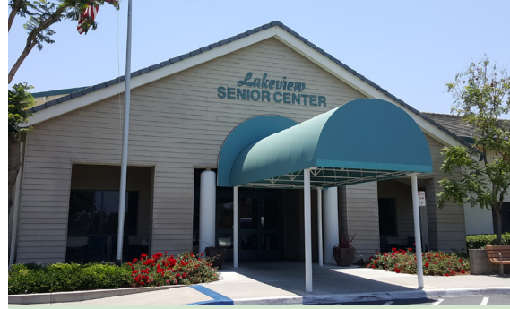
Lakeview Senior Center