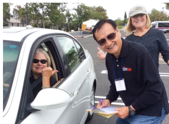
CarFit volunteers help seniors check how well their personal vehicles "fit" them.