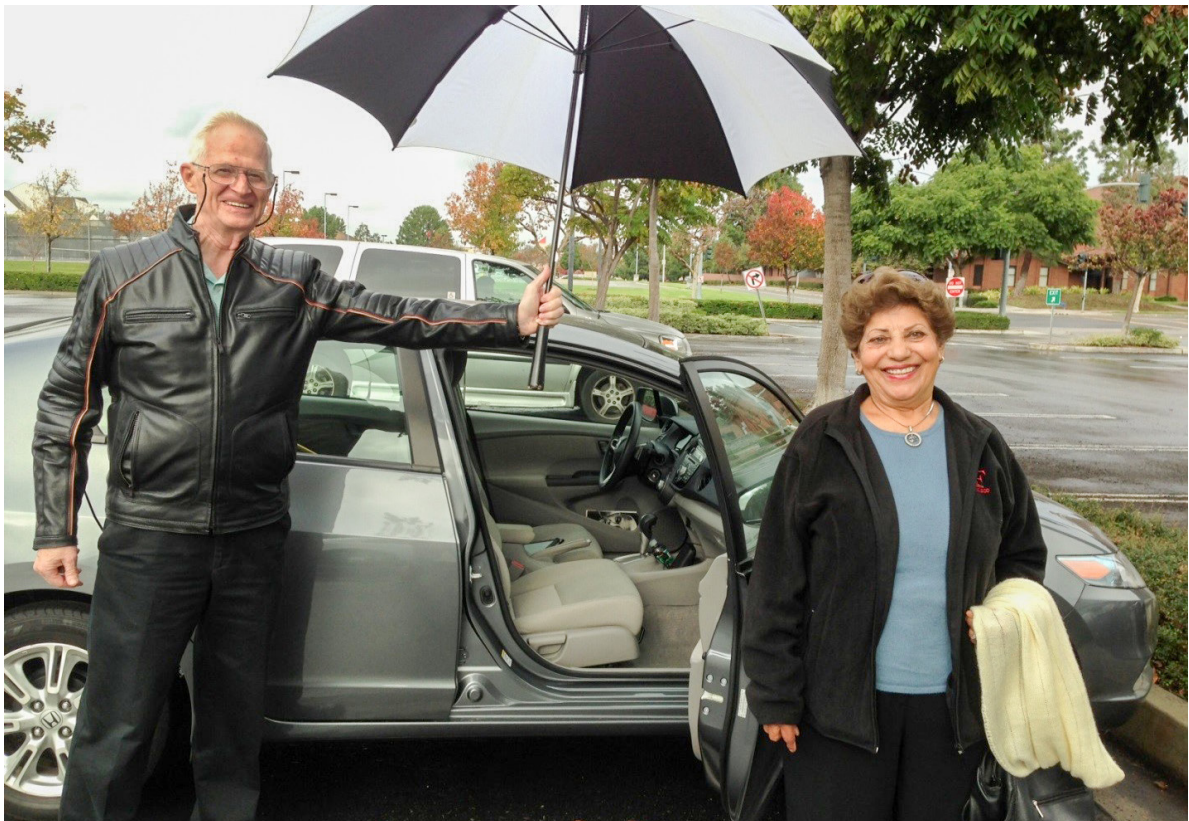
Volunteer drivers provide ride assistance to medical appointments.

Pedestrian safety was also expressed as a concern. Crossing the street in the allotted signal time was mentioned as a challenge for some seniors. "Walkability" was noted as an issue to address, especially near senior housing locations and bus stops.