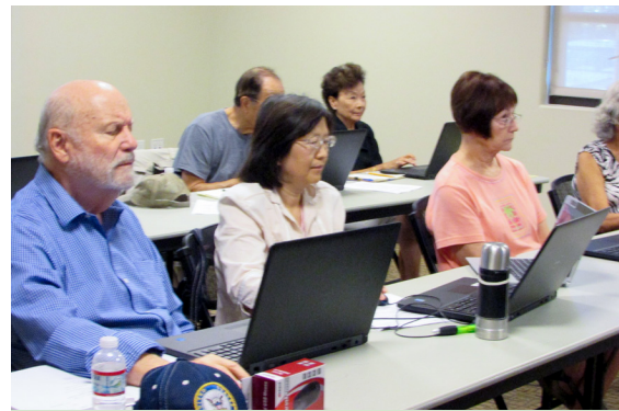
Irvine seniors stay current with the latest technology.

Financial topics of interest include: identity theft self-protection; senior scam protection; and understanding reverse mortgages.