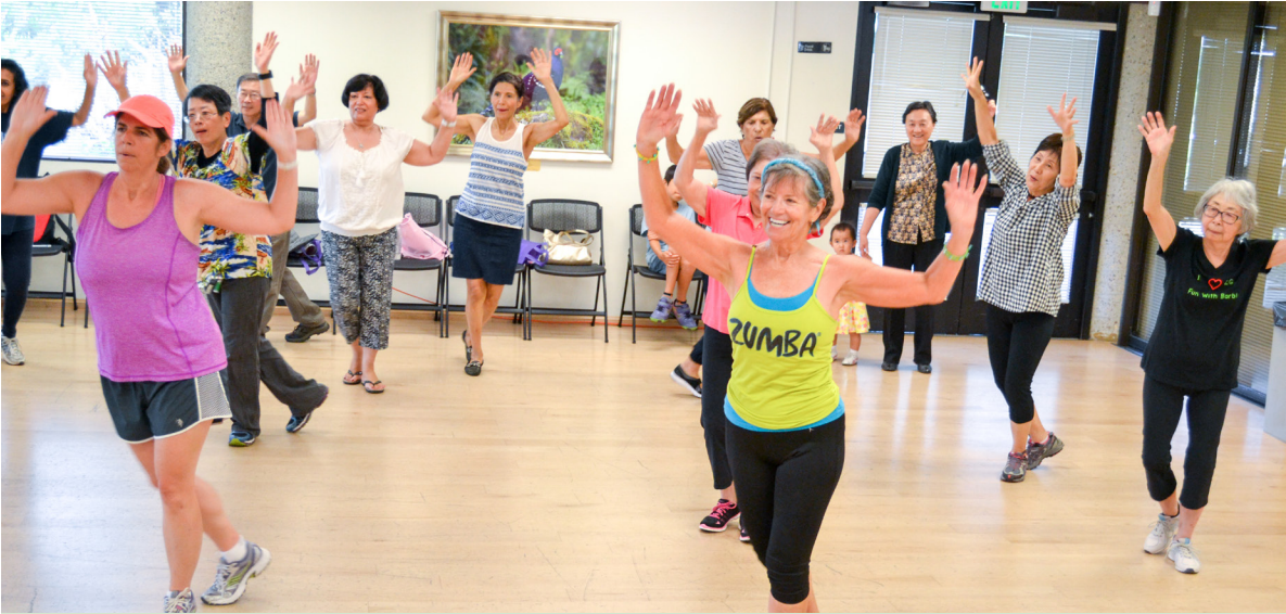
Zumba Gold participants enjoy an energizing dance workout to help improve balance, strength, and flexibility.

Increases in participation achieved during the five-year Senior Plan, along with the general projected growth of the Irvine senior population, indicate that the demand for programs and services will continue to grow. Presenting a range of recreational and health-related activities remains a focus under the Plan Update.