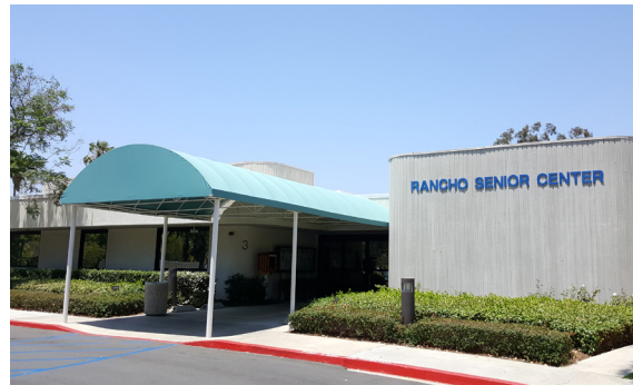
Rancho Senior Center