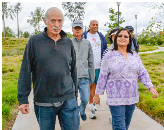
Senior Striders participants enjoy a morning walk along the Jeffrey Open Space Trail.