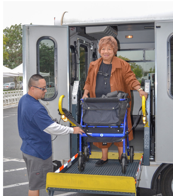
A senior participant takes the lunch shuttle to Lakeview Senior Center for a delicious hot lunch.

Continued collaboration with county and nonprofit transportation providers was discussed as a way to improve the existing network of transportation services. Working with the county to address cost and service area limitations of the ACCESS program was specifically mentioned.