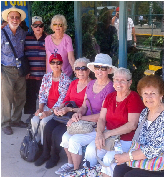
Seniors learn how to ride the Metrolink before taking a trip to Angels stadium.

Seniors also represent the fastest-growing segment of drivers, according to Automobile Association of America Foundation for Traffic Safety. Projections indicate that 25 percent of all drivers will be older than 65 by 2025. 22 With the growing number of non-driving and driving seniors, transportation accessibility, and driver and pedestrian safety remain important issues to address under the Plan Update.