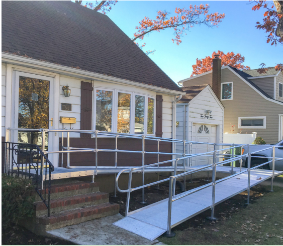
The City provides resources to help seniors with home modifications to support aging in place.

Housing stability and safety impacts the overall well-being of seniors, including one's physical and mental health, and continues to be a priority of the Plan Update.