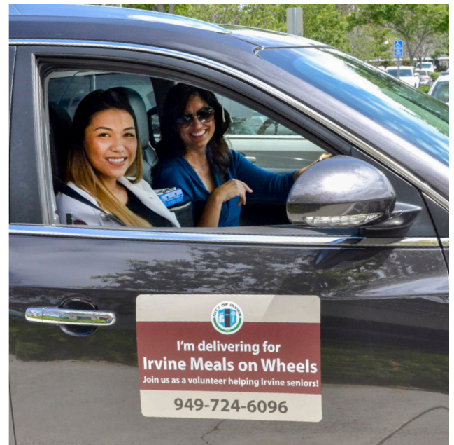
Meals on Wheels volunteers begin their delivery routes.