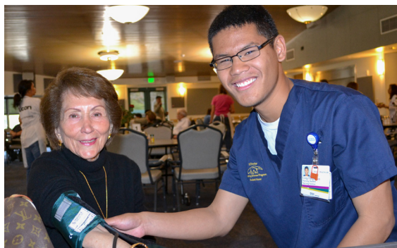
A UC Irvine student provides free blood pressure screenings to Irvine seniors.