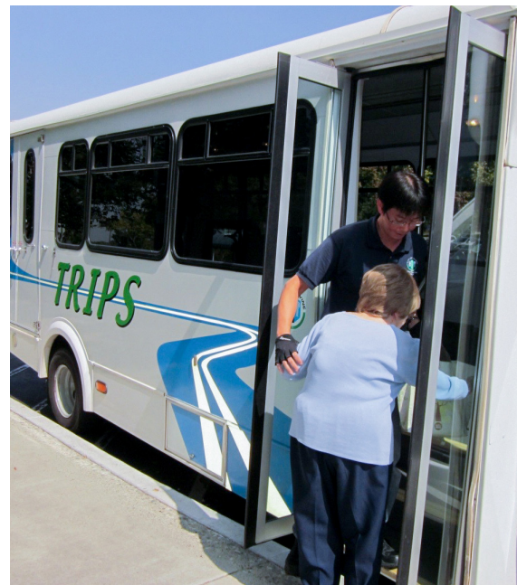
TRIPS provides low-cost, wheelchair accessible transportation to Irvine seniors and adults with disabilities.