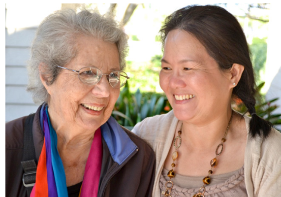
CHAMPION (Community Helpers Assisting Mature Persons in Our Neighborhood) volunteers provide companionship and social interaction to seniors.

Almost 48 percent of Irvine seniors 60 and older are foreign born, compared with 38.9 percent of the City’s general population. Approximately 43.5 percent of seniors report they speak a language other than English at home, and 26.5 percent report they speak English less than “very well” 6