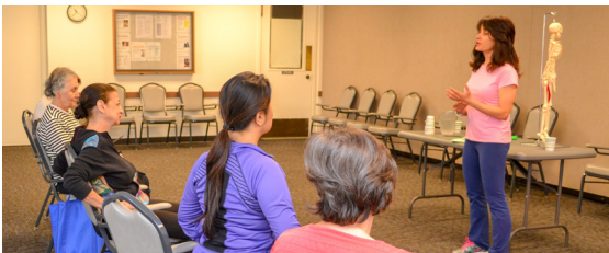
Educational presentations on various topics of interest are offered to Irvine seniors.

Raising awareness about senior resources and services is also an important part of the Plan Update and impacts all five goal areas.