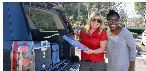
Irvine Meals on Wheels staff and volunteer help provide nutritious meals to homebound Irvine seniors.