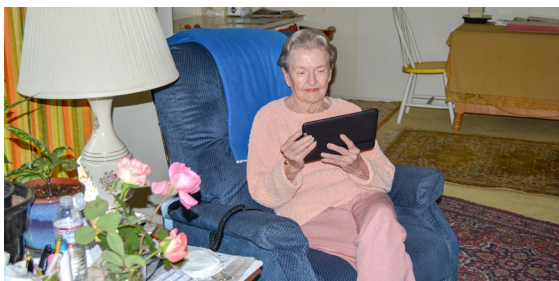
New technology helps seniors stay connected with the community and age safely in place.

The strategies and recommended actions listed to the right address the housing goal of enhancing collaborations and education to address senior housing needs.