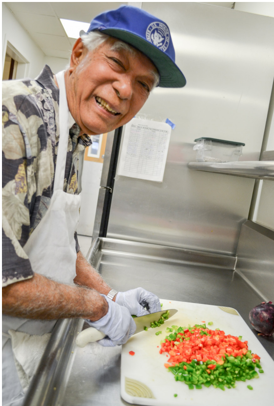
A nutrition volunteer helps prepare food for the Rose Garden Café.

The implementation of the Senior Services Strategic Plan 2012–17 resulted in many successful programs, services, and collaborations as highlighted in the Key Achievements section. To ensure the City continues to proactively support its senior population, the Senior Citizens Council, key stakeholders, and community residents reviewed areas of need and provided feedback on service delivery approaches.