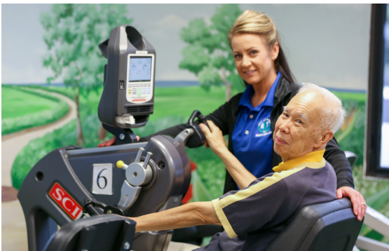
City staff provides assistance to a fitness center participant.